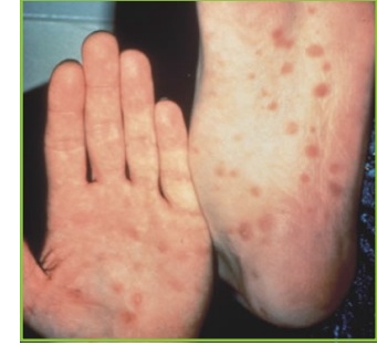
Secondary Syphilis Palmar/ Plantar Rash